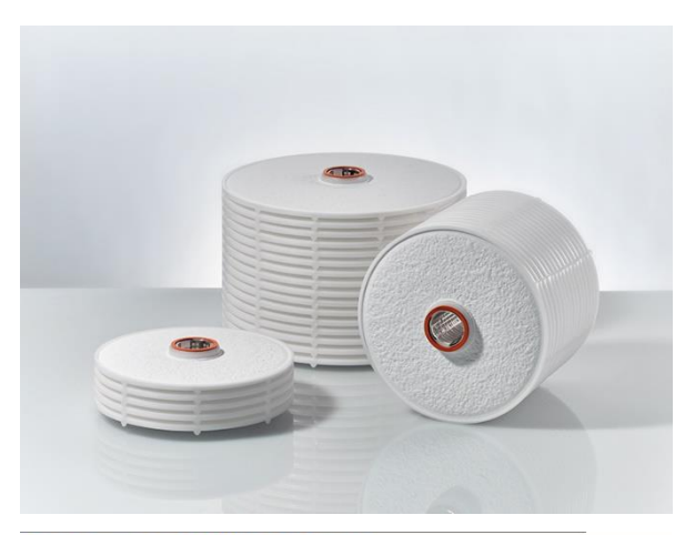
Water throughput BECODISC BT range

Polishing filtration of concentrated sugar solutions of approx. 65 °Brix and filtration of edible oils, vegetable extracts, liquid gelatin, and ointment bases consisting of primary products, oils, varnishes, polymer dispensions and separation of bleaching earth. Possible applications also include removing of activated carbon. Depending upon particle distribution of the activated carbon a single step filtration is possible.