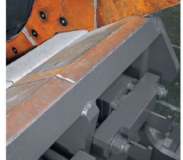
Hydraulic anvil locking device