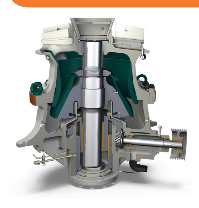
Nordberg® GP330™ cone crusher is the latest member of Nordberg GP range.