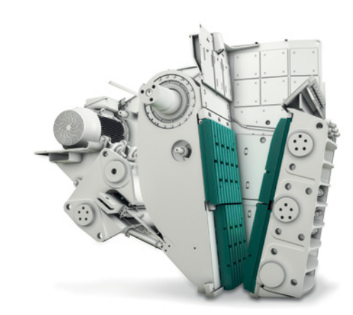
Nordberg® C120™ jaw crusher