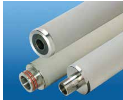
LOFMET filter cartridges are available with a variety of gasket and end cap configurations.

The micron ratings shown at various efficiency and beta ratio value levels were determined through laboratory testing, and can be used as a guide for selecting cartridges and estimating their performance. Under actual field conditions, results may vary somewhat from the values shown due to the variability of filtration parameters. Testing was conducted using the single-pass test method, water at 3 gpm/10" cartridge (9.45 l/min). Contaminants included latex beads, coarse and fine test dust. Removal efficiencies were determined using dual laser source particle counters.