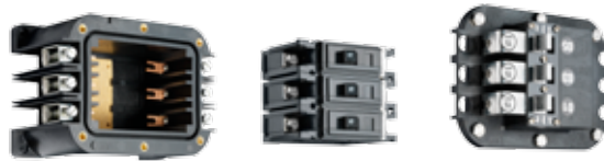
Branch Breaker Module