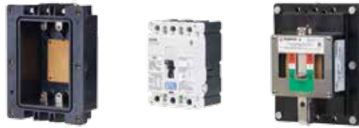
Mains Breaker Module

With component level protection, standard ordinary location circuit breakers can be replaced or upgraded in minutes – with no danger of compromising flamepaths. An optional mains breaker simplifies disconnection of all branch circuits for maintenance, with no disconnect fuses to replace.