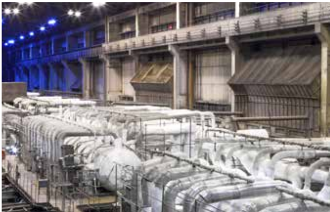
Chemical and Petrochemical Manufacturing

These panelboards are ideal for placement in wet, corrosive environments or where flammable gases or vapors are likely to be present.