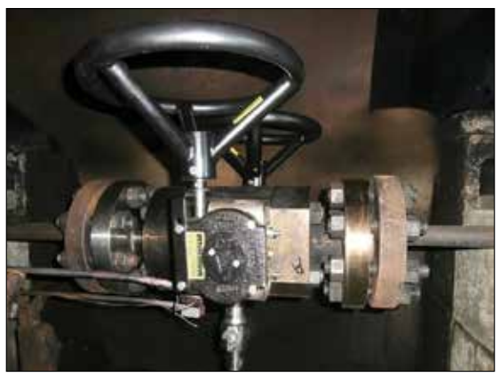
Compact, double block-and-bleed design (prior to fire testing)