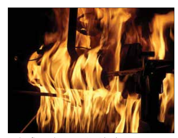
During fire testing to API 607 6th Ed.