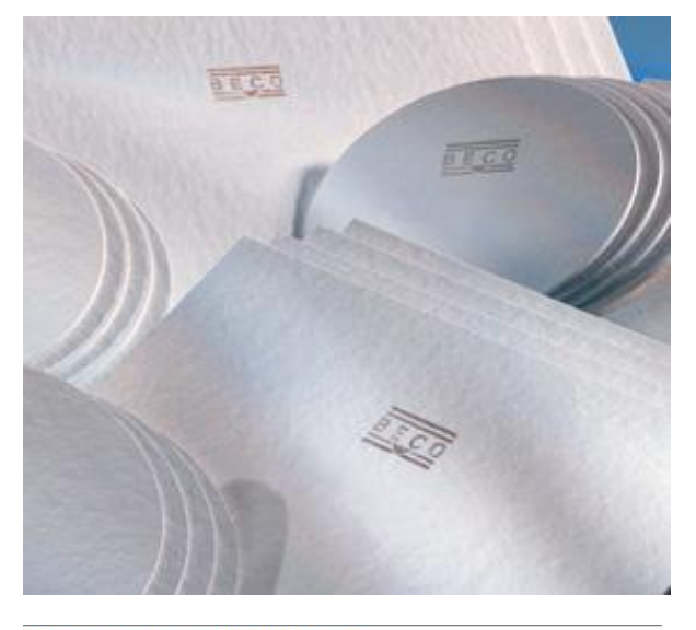
Water throughput BECO CPS range

Polishing filtration of concentrated sugar solution at approx. 65 °Brix and filtration of cooking oils, vegetable extracts, gelatin broths, ointment bases, oils, and filtration of Fuller's earth. Another area of application is separating activated carbon. Depending on the grain size distribution the separation in single-stage fine filtration is even possible.