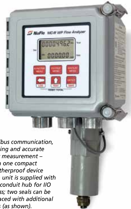
Modbus communication, logging and accurate flow measurement – all in one compact weatherproof device. Each unit is supplied with one conduit hub for I/O access; two seals can be replaced with additional hubs (as shown).

The MC-III WP connects to a turbine meter or a pre-amplifier. Users can select a 4 to 20 mA output, a pulse output, or an amplified flow meter frequency output that allows remote equipment to calculate flow rates and volume.