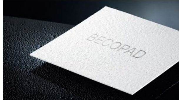
Water throughput BECOPAD P range

BECOPAD P depth filter medium is cationic. It is therefore characterized by charge-related adsorption during filtration. Additionally, the filter medium has a very low content of soluble ions, especially of calcium, magnesium and aluminum. The chemical resistance and bursting strength is extremely high.