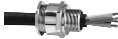
Dimensions in Millimeters (Inches)