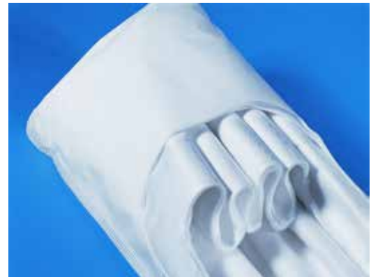
A pleated pre-filter offers a very large filter area (approx. 32 ft² (3 m²)), to retain gels and solids before they reach subsequent filter layers.